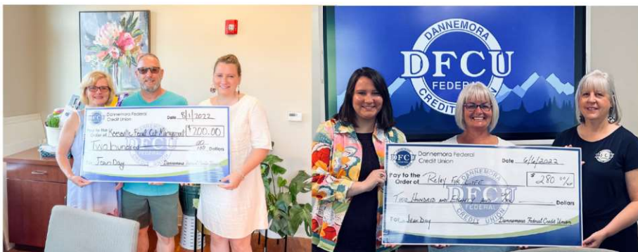
Keeseville Feral Cat Company